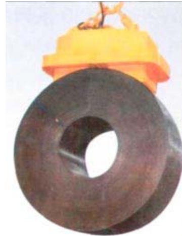
Main technical data