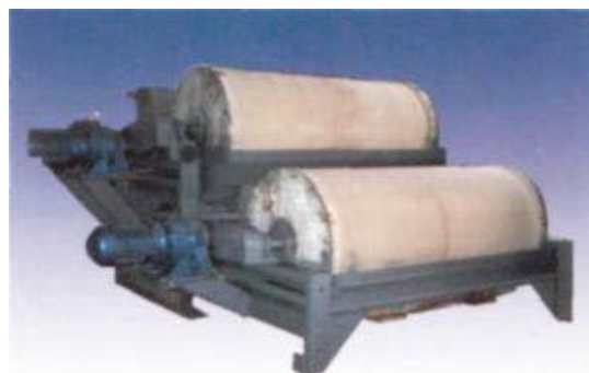
CT series technical parametes